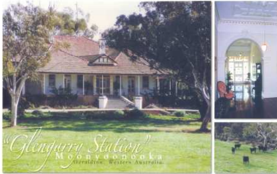
Glengarry Homestead 1910 "in the dry".