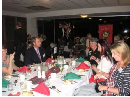
Clan Donald Dinner 2006